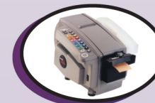
Reinforced Gum Tape