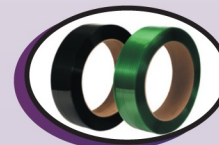
Poly Strapping & Supplies