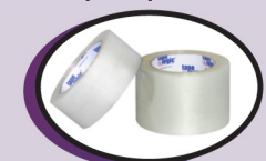
Carton Sealing Tape