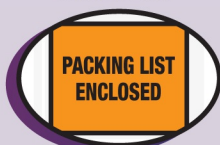
Packing List Envelopes